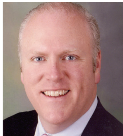
Every year Joe Crowley leads the service to honor those who fell on 9/11. He speaks from the heart with the resolve of never forgetting every victim of the attacks.

St. Michael's is attempting to dedicate a memorial to the 23 NYPD officers who died at the